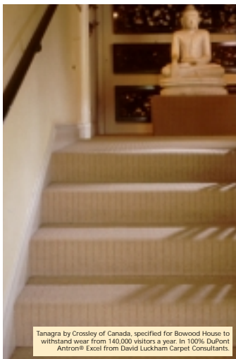
Tanagra by Crossley of Canada, specified for Bowood House to withstand wear from 140,000 visitors a year. In 100% DuPont Antron® Excel from David Luckham Carpet Consultants.