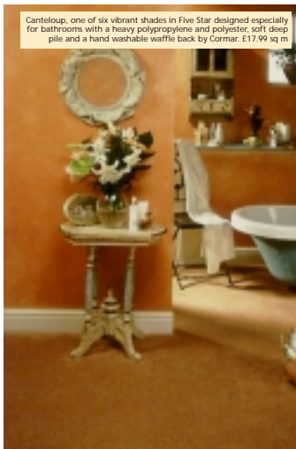
Canteloup, one of six vibrant shades in Five Star designed especially for bathrooms with a heavy polypropylene and polyester, soft deep pile and a hand washable waffle back by Cormar. £17.99 sq m

In addition to tailoring man-made fibres to meet specific performance demands, constant improvements in fibre technology also allow the manufacturers to specify exactly the right yarn for the intended location of the carpet. For example, the characteristics required in a bathroom carpet are not the same as those for a kitchen. The ideal bedroom carpet will need to perform differently to say, a child's playroom. Best of all, rooms subjected to less wear-and-tear can be fitted with the comfort of a wall-to-wall carpet, economically, simply by using man-made fibres in a lower pile weight or density.