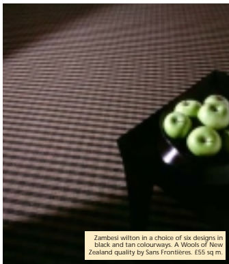
Zambest wilton in a choice of six designs in black and tan colourways. A Wools of New Zealand quality by Sans Frontières. £55 sq m.