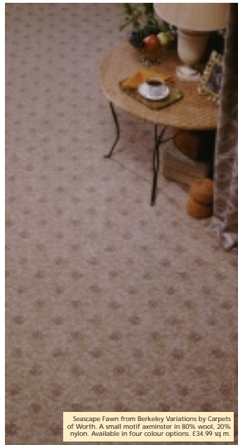
Seascape Fawn from Berkeley Variations by Carpets of Worth. A small motif axminster in 80% wool, 20% nylon. Available in four colour options. £34.99 sq m.

The carpet maker's craft is never more evident than in weaving the intricate and precise patterns of a traditional axminster or wilton. Roundels, checks, lozenges, plaids, diamonds and even Fleur-de-Lys are now regularly appearing in the carpet designer's portfolio. Matched with a Greek Key or Adam Scroll border, they are opening up new interior design possibilities for even the most modest suburban semi.