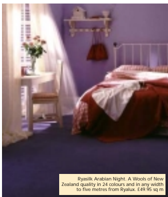
Ryasilk Arabian Night. A Wools of New Zealand quality in 24 colours and in any width to five metres from Ryalux. £49.95 sq m