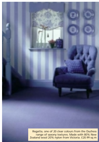
Regatta, one of 20 clear colours from the Duchess range of saxony textures. Made with 80% New Zealand wool 20% nylon from Victoria. £20.99 sq m