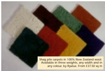
Shag pile carpets in 100% New Zealand wool. Available in three weights, any width and in any colour, by Ryalux. From £37.50 sq m