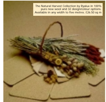
The Natural Harvest Collection by Ryalux in 100% pure new wool and 32 design/colour options. Available in any width to five metres. £26.50 sq m.

The "hand-spun" natural look, which first appeared some years ago as Berber, has been refined and now appears with a much smoother yarn. Available in level loop or high/low loops giving a textured appearance and also with different coloured yarns which create a washed background. Mainly made in 100% wool, to provide a softer alternative to coir, seagrass and other vegetable fibres, loop pile textures are enjoying huge popularity.