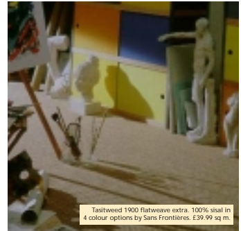
Tastweed 1900 flatweave extra. 100% sisal in 4 colour options by Sans Frontières. £39.99 sq m.