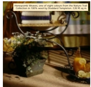
Honeycomb Weaves, one of eight colours from the Nature Trail Collection in 100% wool by Stoddard Templeton. £28.95 sq m.