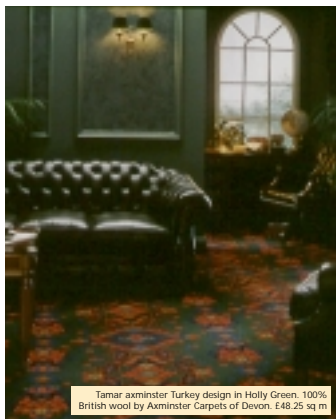
Tamar axminster Turkey design in Holly Green. 100% British wool by Axminster Carpets of Devon. £48.25/sq m