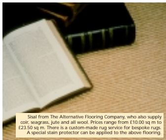
Sisal from The Alternative Flooring Company, who also supply coir, seagrass, jute and all wool. Prices range from £10.00/sq m to £23.50/sq m. There is a custom-made rug service for bespoke rugs. A special stain protector can be applied to the above flooring.

Other natural fibres include seagrass, coir and sisal, all of which are enjoying a fashion revival. Mainly available in the natural look, especially in loop pile textures, they are hardwearing and reasonably inexpensive. Generally, the quality of these vegetable based fibres depends on climatic and growing conditions. The best sisal originates in Tanzania, although the spinning and manufacture into floocovering, is undertaken in Europe to recognised standards. (ISO 9001) Beware of allowing vegetable fibres to become too wet and always ensure that they are layed professionally.