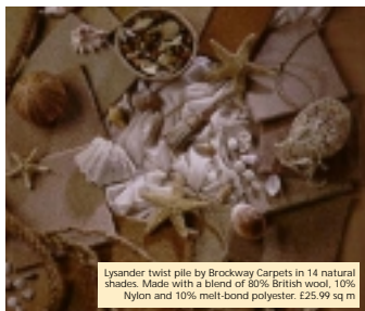
Lyander twist pile by Brockway Carpets in 14 natural shades. Made with a blend of 80% British wool, 10% Nylon and 10% melt-bond polyester. £25.99/sq m