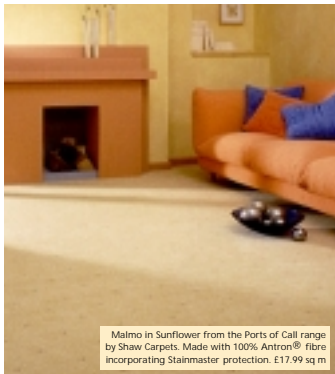
Malmö in Sunflower from the Ports of Call range by Shaw Carpets. Made with 100% Antron ® fibre incorporating Stainmaster protection. £17.99 sq m