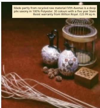
Made partly from recycled raw material Fifth Avenue is a deep pile saxony in 100% Polyester. 30 colours with a five year Stain Resist warranty from Wilton Royal. £23.99 sq m