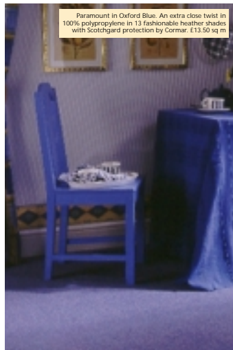
Paramount in Oxford Blue. An extra close twist in 100% polypropylene in 13 fashionable heather shades with Scotchgard protection by Cormar. £13.50 sq m