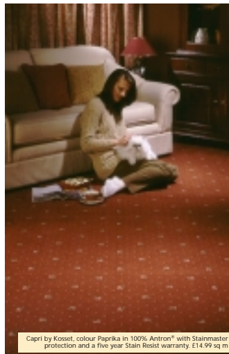
Capri by Kosset, colour Paprika in 100% Antron ® with Stainmaster protection and a five year Stain Resist warranty. £14.99 sq m