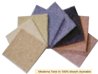
Moderna Twist in 100% bleach cleanable polypropylene by Kingmead. £16.99 sq m

The leading branded fibre is DuPont's Antron ® , which incorporates either Teflon ® Super Protection or Stainmaster and can be seen in scores of qualities and colour textures.