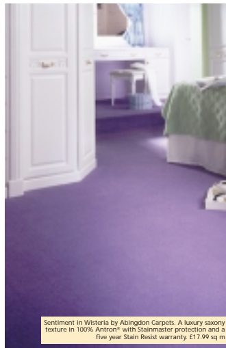
Sentiment in Wisteria by Abingdon Carpets. A luxury saxony texture in 100% Antron ® with Stainmaster protection and a five year Stain Resist warranty. £17.99 sq m